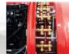
A twin nozzle with adjustable dose.