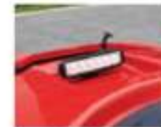
Spray Check LED Light