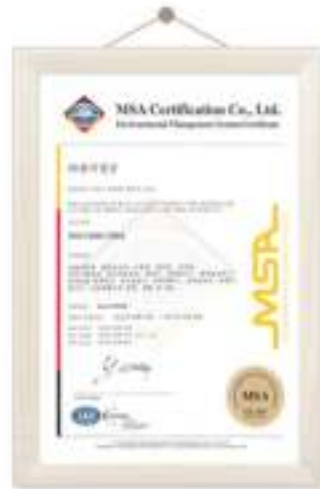
Certification of ISO 14001 Environmental Administration