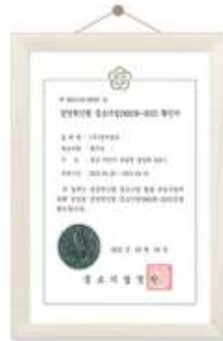
Certification of Innovative