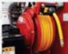
Automatic Electric Reel