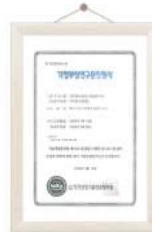
Official Approval of R&D Center