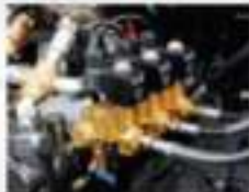
European style electric valve