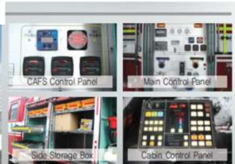
CAFS Control Panel