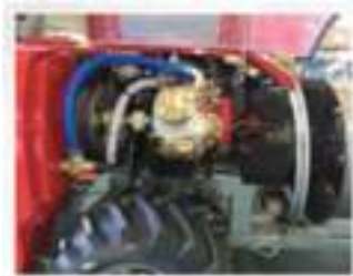
Italian pump with excellent performance