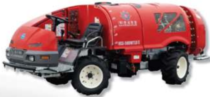
Model : HSS-500WTLD