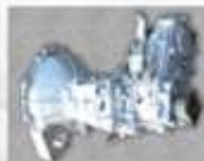
Kia Frontier Mission