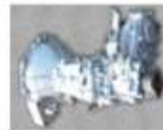
kia frontier mission