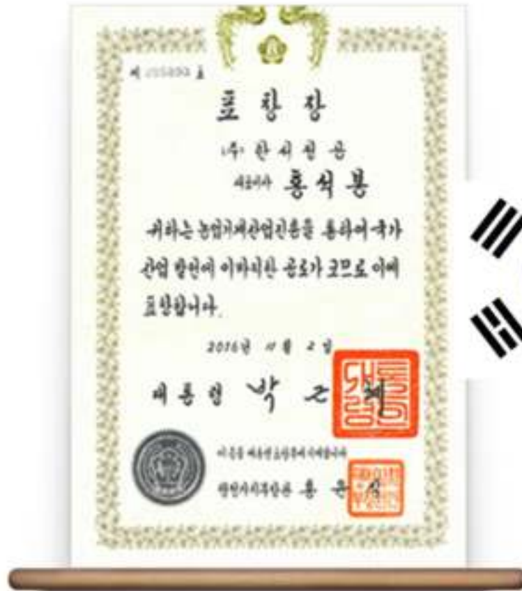
2016 Korea President Award for contributing greatly to national industrial development with Agricultural machinery