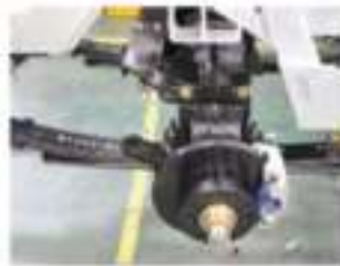
Independent brake and plate spring