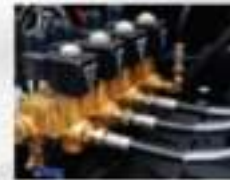
italian four-part valve