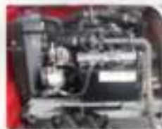
54 horsepower diesel engine