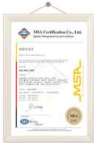
Certification of ISO 9001 Quality Administration