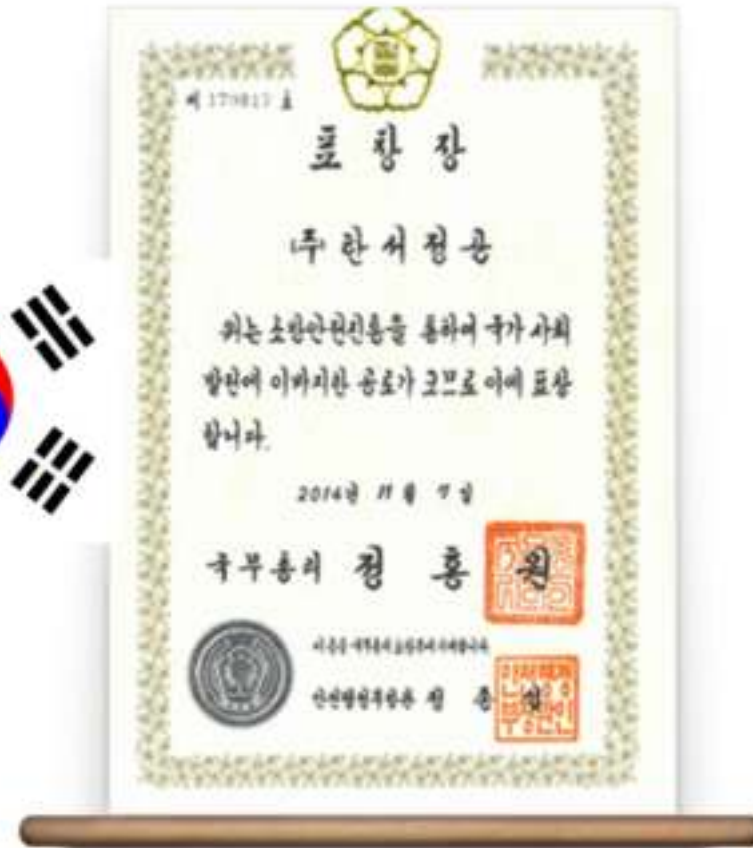
2014 Prime minister Award for contribute to national social development through fire-safety promotion. (safety of fire-fighting)