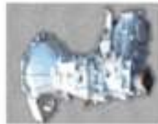
kia frontier mission