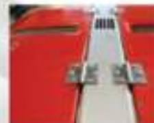
Strong hot-dip plating frame