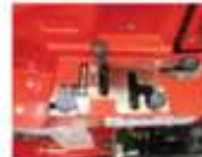
Simple shift lever