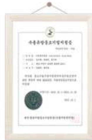
Certification of Promising Company