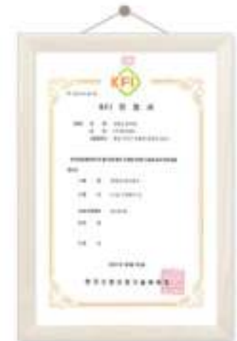
Certification of KFI