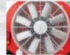
Powerful aluminum fan