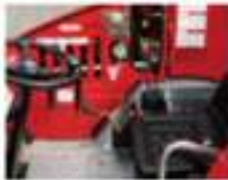
Spacious driver's seat