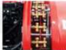
A twin nozzle with adjustable dose.